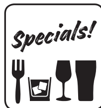
FOOD AND DRINK SPECIALS DAILY