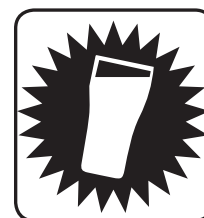
EXCLUSIVE BREWERY COLLABORATIONS