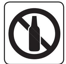
NO BOTTLED BEER