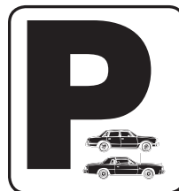
PARKING VAILIDATION AVAILABLE