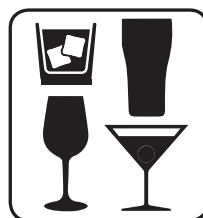
BAR TYPE FULL