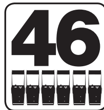
CLASSIC ARCADE GAMES

494 BROAD STREET NEWARK, NJ 07102 infonewark@barcade.com